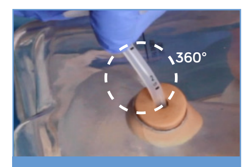
Advance the tube 2-3cm into the stomach and rotate 360°