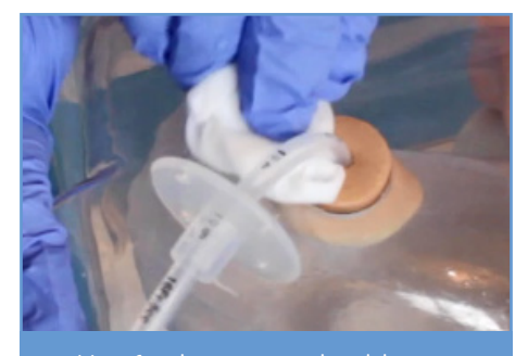
Use fresh water and mild soap solution to clean the skin around the stoma site, then dry thoroughly