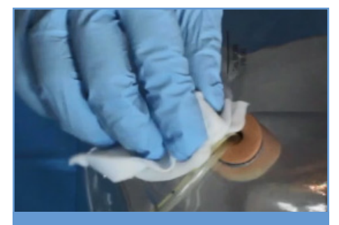
Clean the skin around the stoma site using cooled boiled water*, a clean cloth/gauze, then dry thoroughly