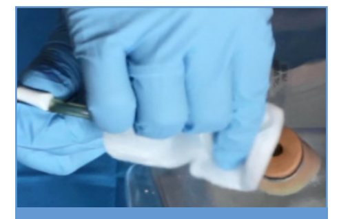
Make sure to clean the tube with a fresh cloth or gauze where it will be pushed into the patient's stomach