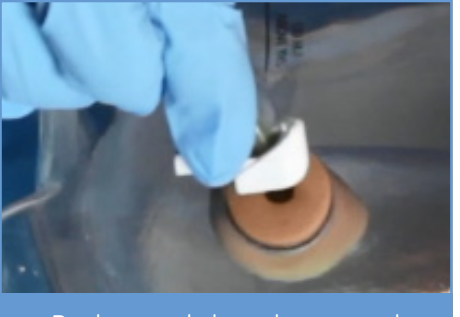
Replace and close the external fixation device so it lies 2-5mm from the skin surface

If the cm graduation marking has changed, if there is any discomfort, or you are unable to advance or rotate the tube, DO NOT use the tube and contact the managing healthcare professional or Nutricia Homeward Nurse immediately.