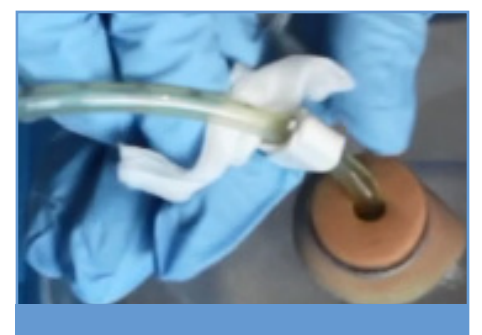
Ensure the skin and fixation device are thoroughly dried