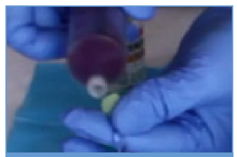
Detach the syringe from the tube and replace the end cap