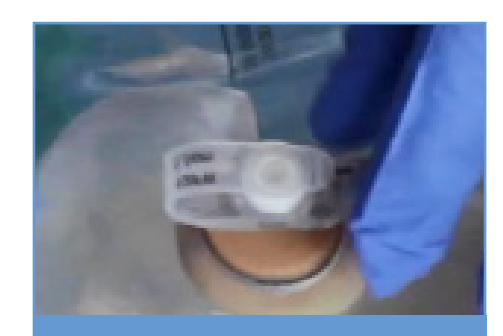
Detach the extension set and carefully close the Button