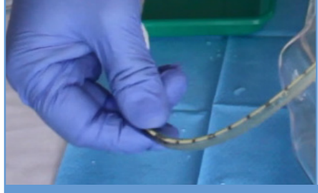
You can also gently squeeze the tube between your fingers along the length of the tube as fas as possible

Repeat these steps as required. Be sure to change the water in the syringe to ensure it remains warm. You can also use soda water for this purpose.