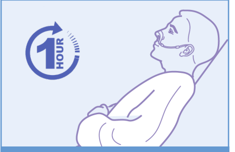
Ensure the patient remains in this position of 30-45° for at least one hour post flush

If the blockage persists contact the managing healthcare professional for further instructions on how to proceed.