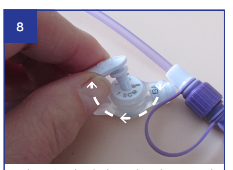
When finished, close the clamp and turn the extension set half a turn anticlockwise to match up the markings, gently pull the extension set to remove from the tube