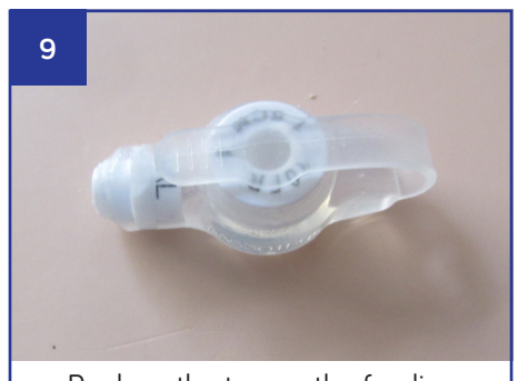
Replace the top on the feeding tube to prevent any leakage. The extension set should be cleaned/ changed as directed by your healthcare professional