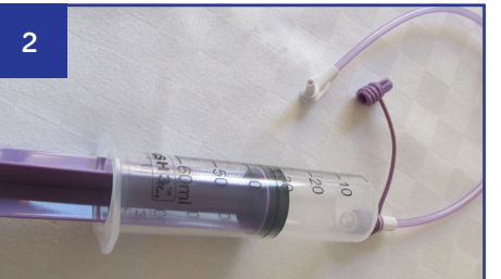
Attach the syringe and flush the extension set with water, as advised by your healthcare professional