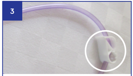
Remove the syringe and close the clamp on the extension set