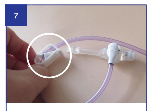
Attach your syringe or giving set and open the clamp to allow your prescribed feed/water/medication to pass safely through your feeding tube